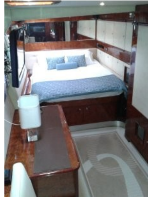
Starboard Owners cabin