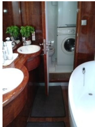
Starboard bathroom to laundry/toilet