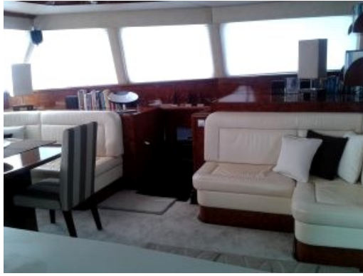
Saloon with access to starboard hull