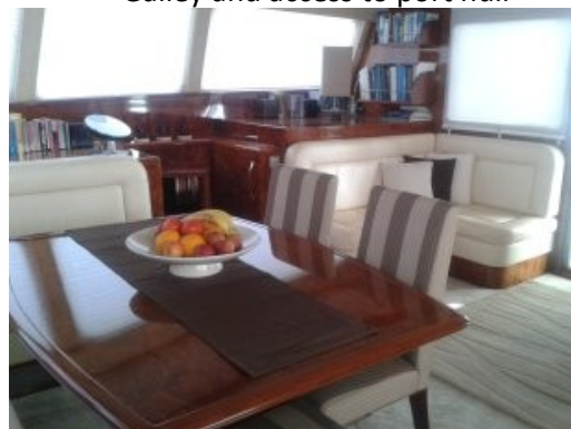
Saloon dining table with separate seat