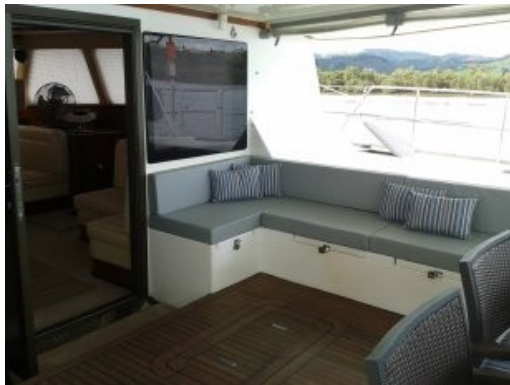
Aft deck - separate seating