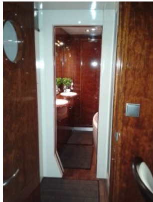
Starboard bathroom access