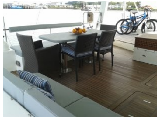
Aft deck - breakfast table