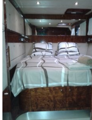
Port aft cabin