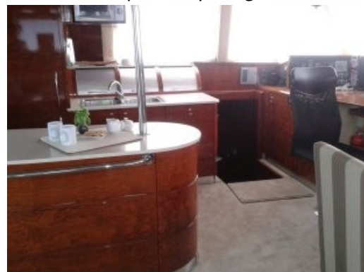
Galley and access to port hull