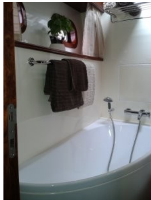
Starboard bathroom – bath