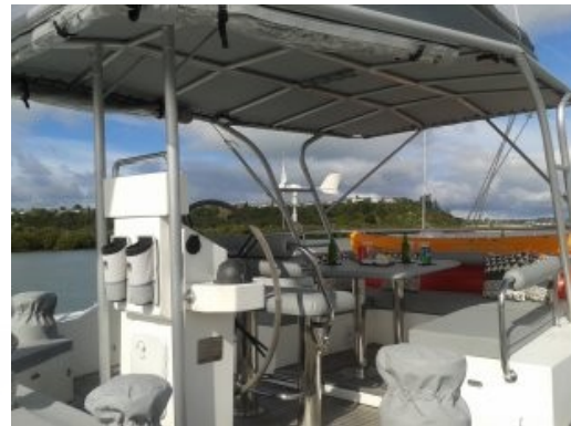
Top deck fly bridge