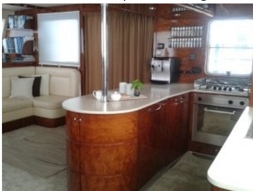
Galley and separate saloon seating