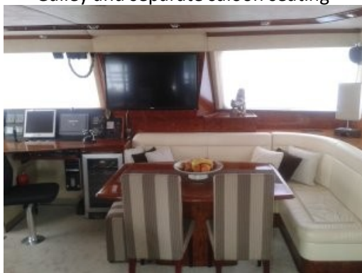
Saloon dining table next to chart table