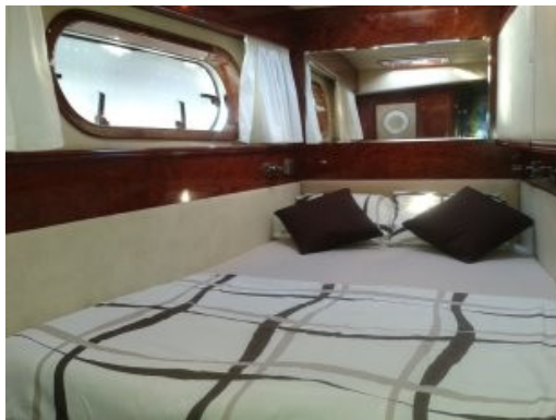
Port side forward cabin